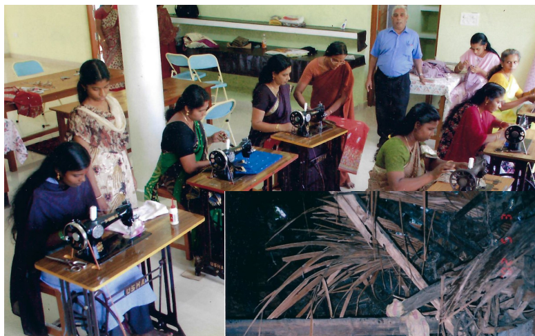
Ministries in India that ICLD has helped by sending Christian literature