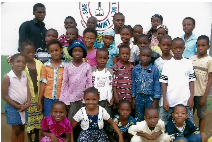
Vacation Bible School Students in Nigeria

Thank you to those who have chosen to make a legacy statement to God’s work through ICLD.