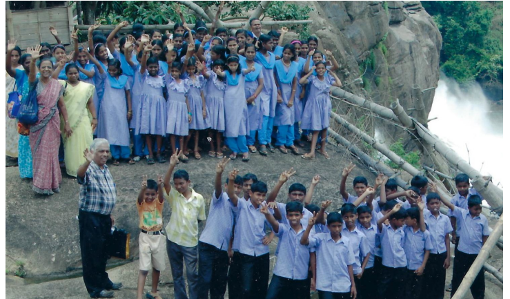
Orphan children from Cheppad, India, who benefit from literature received from ICLD

From Nagaland, Northeast India: “I did my Theological degree Master of Divinity. I have a strong desire to study more about God’s word including Commentary and Bible Dictionary as well as other books. But no book is available at home and there is no library available since I live in an Indian small village. Hence, I do heartily and humbly request you to kindly send me some books to read so that I can improve my knowledge about God’s word and prepare a sermon well.”