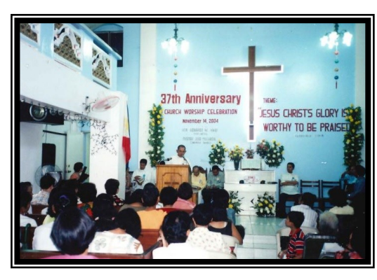
Our Church Anniversary Celebration Philippines 5/23/12