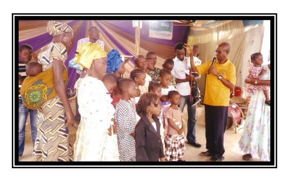
Children Annual Celebration Sunday Sept. Nigeria 11/7/12